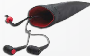
ThinkPad In-Ear Headphones with microphone (57Y4488)