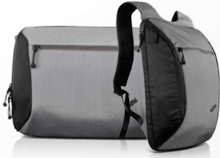
ThinkPad® Ultralight™ Backpack (0B47306) and Topload (0B47307)

Whether it is improving usability or enhancing performance, these specially designed Lenovo accessories will make your PC experience better.