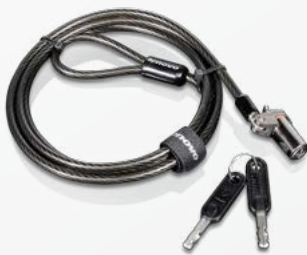
Kensington Microsaver DS Cable Lock (0B47388)