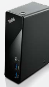
ThinkPad USB 3.0 Dock (0A33970)